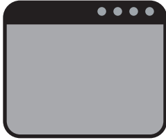
Amp (Fender Deville)