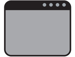
Lead Guitar Amp